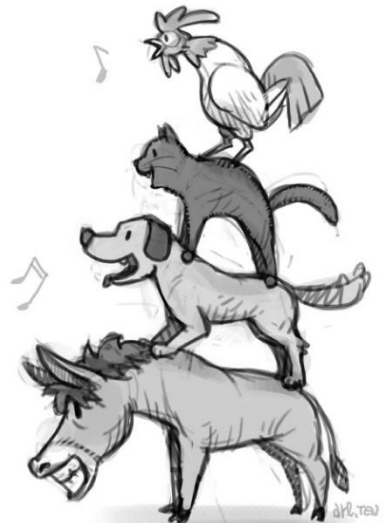
THE BREMEN TOWN MUSICIANS.

We are so excited about the upcoming production of "Bremen Town Jam!" The students have been working extremely hard in class to prepare for the upcoming production. Each student had the opportunity to choose how they would like to become involved in the musical. Please ask your student which task they have chosen. The student's part is also highlighted below. Here are the expectations for each part.